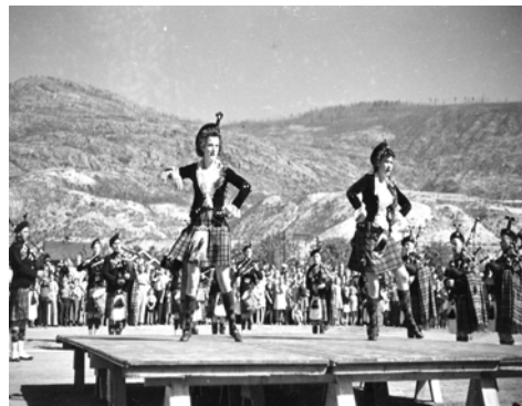
Scottish dancers perform to the Pipe band at Butler Park.

November 30, Hogmany (Scottish New Year's Eve) on December 31, and Burns Night on January 25. The Soci-