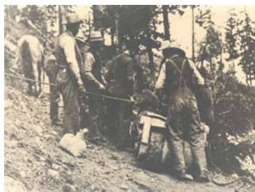
One of the many photographs, archival documents and artifacts that will be used in the Virtual Museum of the Kootenay's Dewdney Trail on-line exhibit. This is the construction of the trail near Rossland.

The Virtual Museum of the Kootenays Project has received funding for a "virtual museum" on line, with an exhibit dedicated to the Dewdney Trail. The Trail Museum and Trail City Archives are a part of