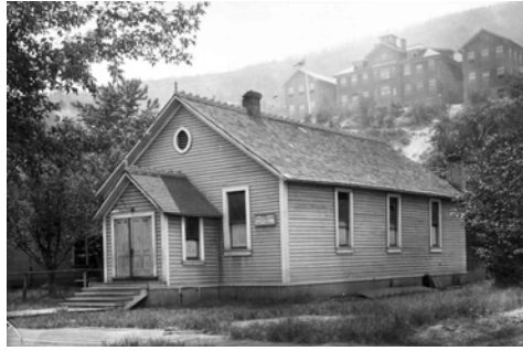
Trail's first Presbyterian Church - originally located on Spokane St. In 1896, it was moved to this location on Pine Avenue.

This year, the British Columbia Historical Federation selected this year's theme to be "Heritage of Faith: Sacred Buildings and Spiritual Places." To honour Heritage Week this year, the Society appealed to all local churches to fashion an informative display that would tell the stories of their establishments in Trail. After letters and several follow-up calls, 10 churches agreed to participate. The Society would like to thank these churches for their participation in this year's Heritage Week: Emmanuel Baptist Church, Peace Lutheran Church, Our Lady of Perpetual Help Church, St. Anthony's of Padua, Knox United Church, St. Andrew's Church, Gateway Christian Life, Trail Presbyterian Church, and the Salvation Army Church. Look for their stories in the Trail Daily Times during